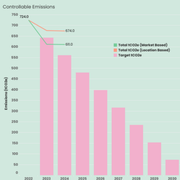
Figure 1. Projected and actual controllable emissions (tCO 2 e) against set targets, from baseline year to latest reporting year. Scope 2 emissions are location-based.

We're committed to achieving net zero across our controllable emissions (scopes 1 & 2, and scope 3 categories 3, 4, 5, & 6) by 2030, in line with the latest climate science which instructs rapid decarbonisation. After exploring our data for all scope 3 categories, we have adjusted our net zero target for all influence-able emissions (scope 3 categories 1, 7, & 9) to 2035. Our ambition and progress is illustrated in the graph below: